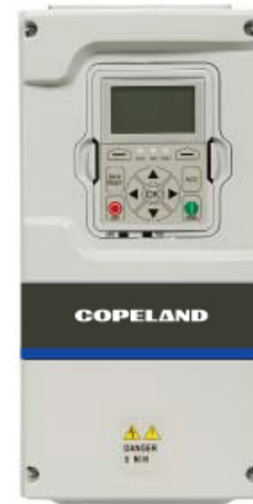
Copeland commercial HVACR variable frequency drive EVM Series